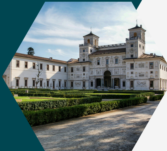
Galleria Borghese and all the worderfoul green spaces