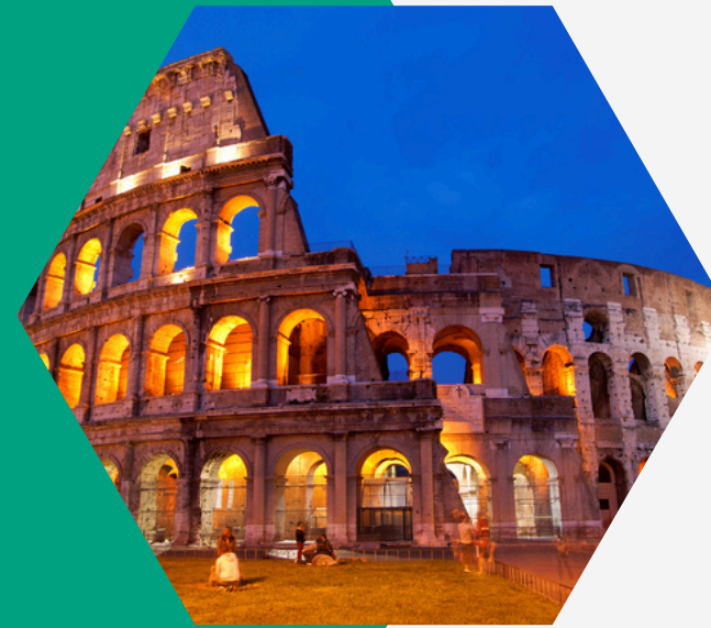
The Colosseum and the Ancient Rome

A series of social activities are planned to uncover some hidden sides of Italy's capital city in addition to the most famous