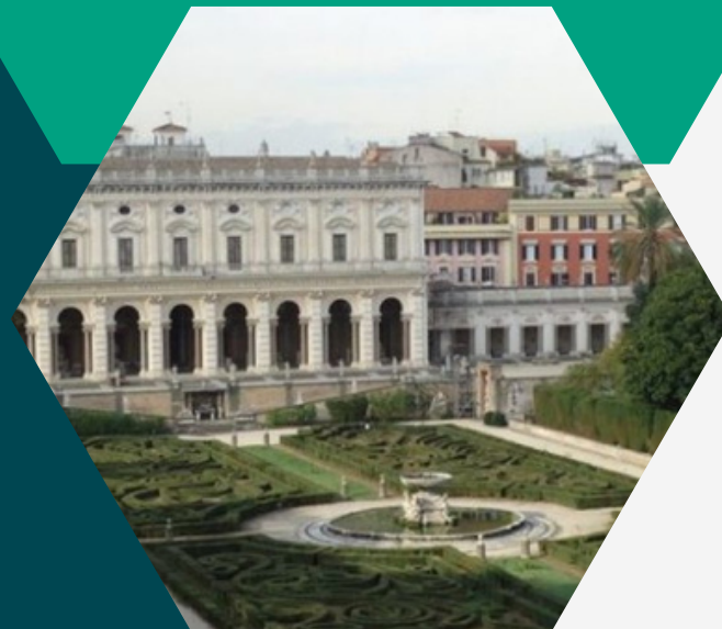
Villa Albani Torlonia